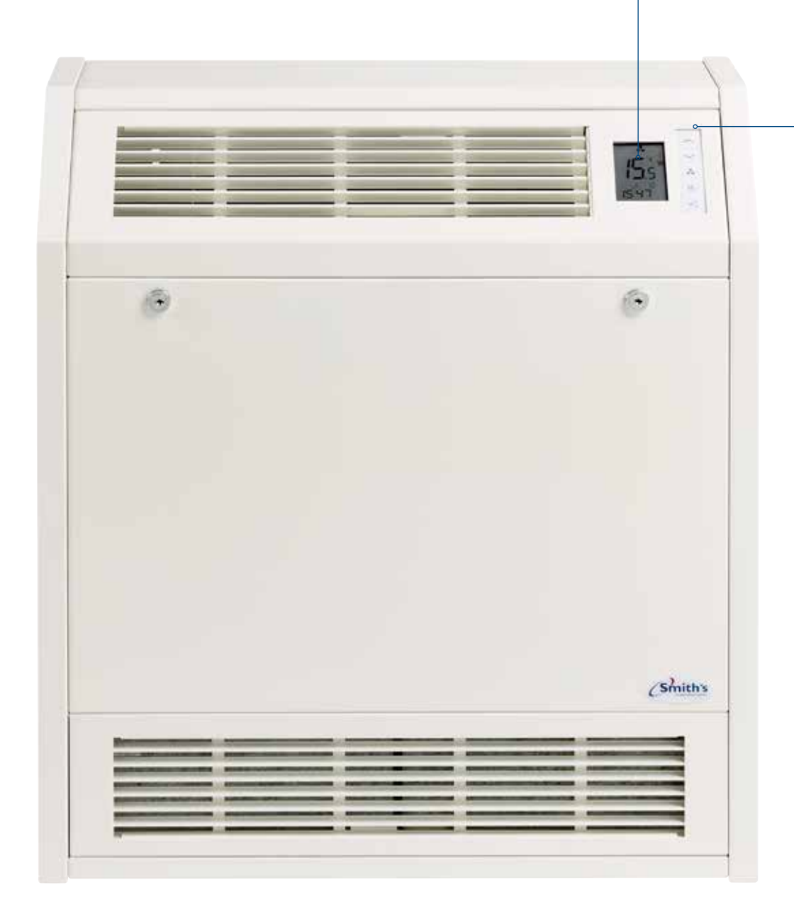
The control interface unit can be: